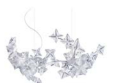
PRISMA TRANSP. WIRE