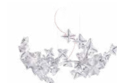
PRISMA RED WIRE